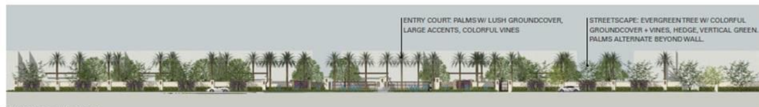
ELEVATION - LOOKING NORTH