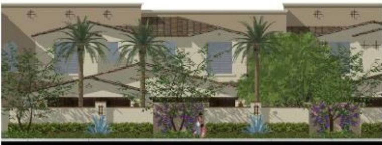
2 STREETScape WALL ELEVATION