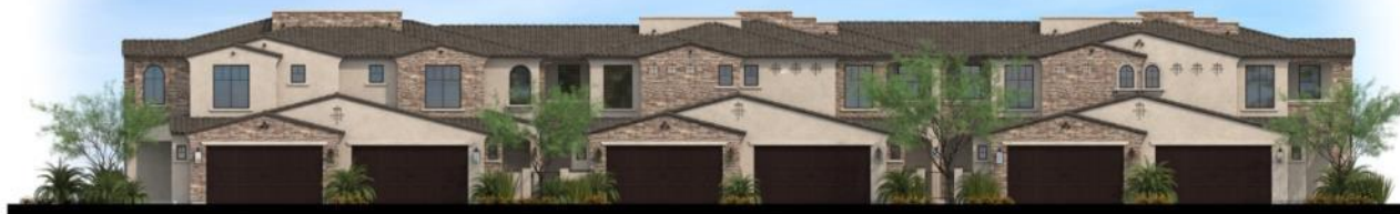
Building 1 Six Units