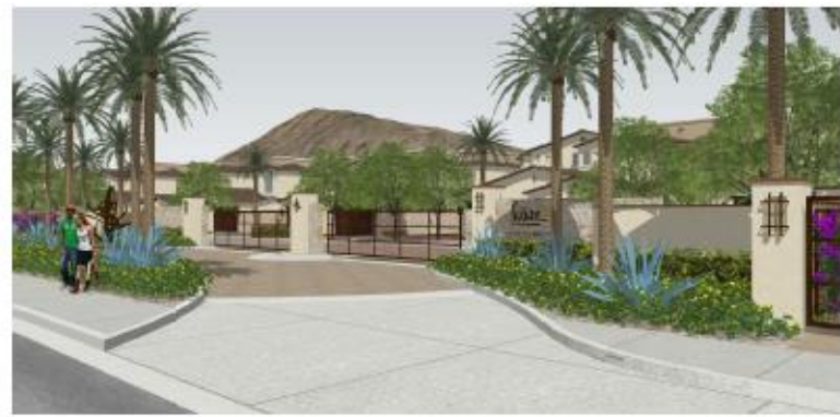
3 ENTRY PERSPECTIVE

SALES ARE CONDITIONED UPON RECEIPT AND ACCEPTANCE OF THE ADRE PUBLIC REPORT. PRICING AND FLOOR PLAN DESIGN IS SUBJECT TO CHANGE WITHOUT NOTICE. SELLER RESERVES THE RIGHT TO SUBSTITUTE MATERIALS, COMPONENTS, FIXTURES, AND EQUIPMENT OF EQUAL UTILITY OR QUALITY TO THOSE SPECIFIED.