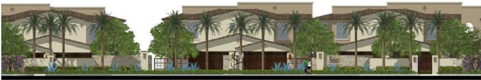
1 ENTRY ELEVATION