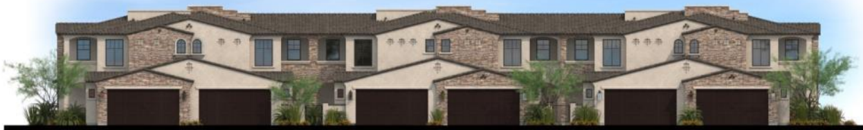
Building 2 Six Units