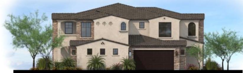
Building 3 Two Units

SALES ARE CONDITIONED UPON RECEIPT AND ACCEPTANCE OF THE ADRE PUBLIC REPORT. PRICING AND FLOOR PLAN DESIGN IS SUBJECT TO CHANGE WITHOUT NOTICE. SELLER RESERVES THE RIGHT TO SUBSTITUTE MATERIALS, COMPONENTS, FIXTURES, AND EQUIPMENT OF EQUAL UTILITY OR QUALITY TO THOSE SPECIFIED.